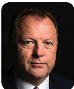
Marius L. VIZER IJF President

The World Judo Tour will remain in Abu Dhabi for the second Grand Slam in the United Arab Emirates from 30 October – 1 November which comes days after the 2015 Junior World Championships in the capital city.